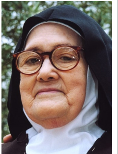
Sister Maria Lúcia of Jesus and of the Immaculate Heart 1907—2005

"There is no problem, however difficult, whether temporal or spiritual; no problem in the life of families, Religious Communities, or the life of nations, that cannot be solved by the Rosary."