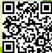
QR code for joining the virtual support group.

Questions? Email vac@richmonddiocese.org