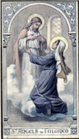
A holy card depicting Saint Angela

Our mission is to unite all women of St. Jude and Immaculate Conception Parishes through Religious and Educational activities.